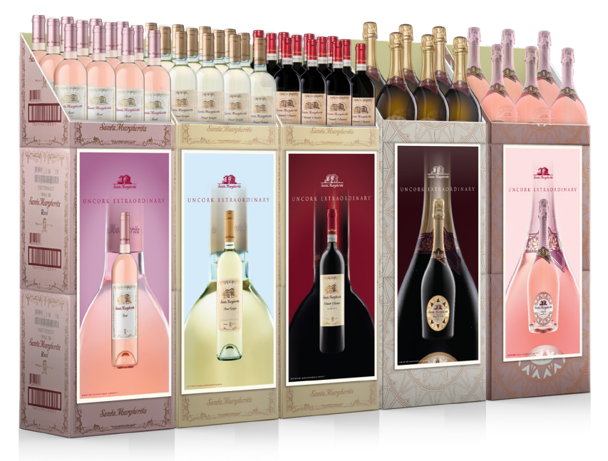
Glorifiers - 12" L x 23.5" H Find our print-ready files at SantaMargheritaUSA.com/trade-resources/santa-margherita/