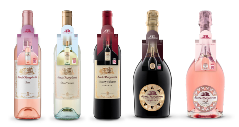
Bottle Neckers - 2.25" L x 4.5" H Each QR code leads the consumer to our https://santamargheritawines.com/ product page video content.

Each QR code leads the consumer to our https://santamargheritawines.com/ product page video content.