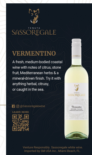
Cold Box Cling 3" W x 5" L

100% recyclable, repositionable, and reusable materials.