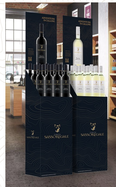
Glorifiers with Adhesive Strips 12" W x 23.5" L (2" fold from top)