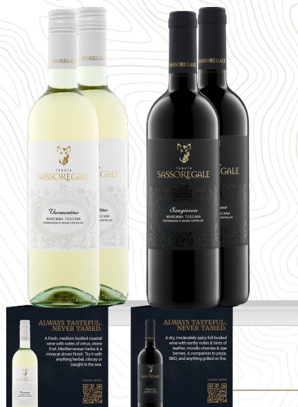
Shelf Talkers with Adhesive Strip 3" W x 3.75" L and .75" top fold

Sassoregale's certified organically farmed vineyards come from Italy's Wild West, the Tuscan Maremma, between Bolgheri and the famous hills of Montalcino. Over 150,000 wild boars, known as "Cinghiale," and local cowboys called "butteri" still roam in this area. In 2022, we will continue to emulate our untamed nature through our multi-dimensional aerial map creative on all print POS. New QR codes will come into the fold to drive to our brand website to learn more.