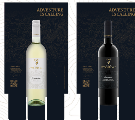
Double-sided Case Cards 13.5" W x 25.4" L