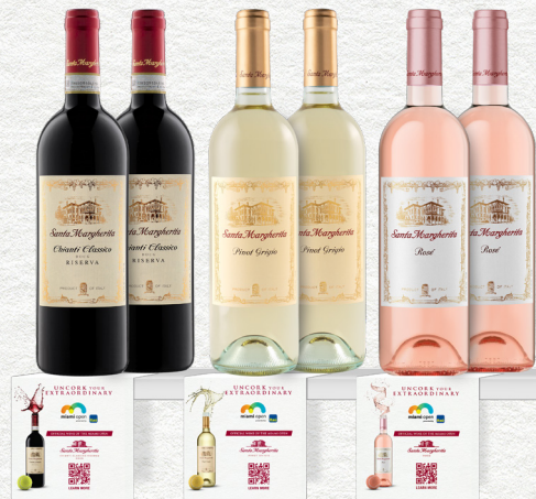
Shelf Talkers 3" W x 3.75" H