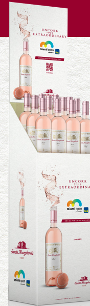
Case Sleeve 47.9" W x 36.6" H