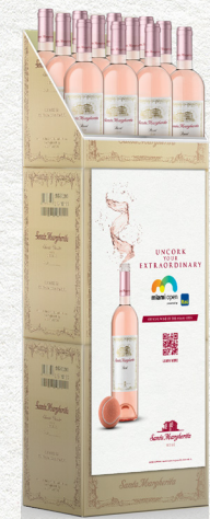
Case Glorifiers 12" W x 23.5" H

Find our print-ready files at SantaMargheritaUSA.com/trade-resources/santa-margherita/