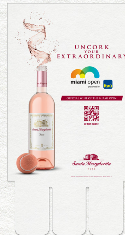
Double-Sided Case Cards 13.53" W x 25.44" H