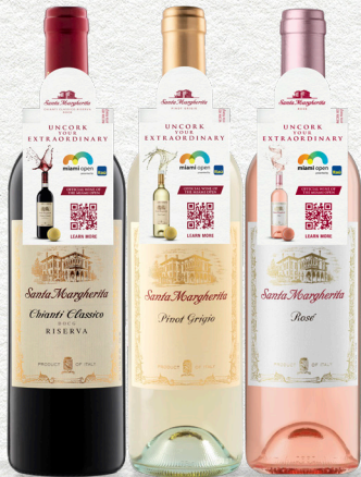
Neckers 2.25" W x 4.5" H

QR code leads to the landing page for the sweepstakes entry.