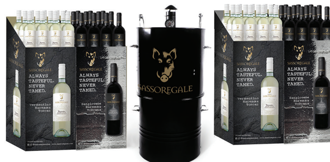
5-in-1 Oil-Drum Grill