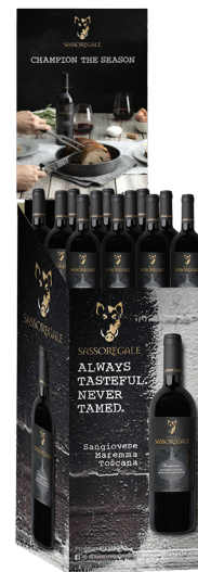
Case Cards & Case Sleeves (4 cases per sleeve)