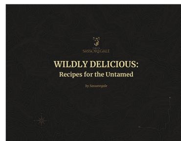
5" by 4" Recipe Booklet