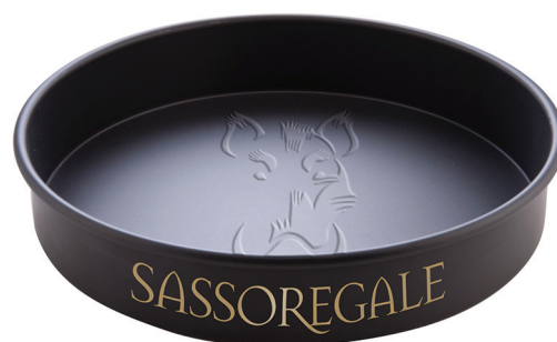
10" by 2" Carbon Steel Pan