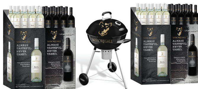
Original 18" Weber Charcoal Grill