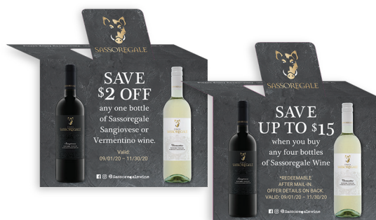
MIR/IRC Offers (Run 9/1 – 11/30)