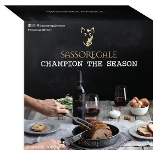
Print-Ready Shelf Talkers