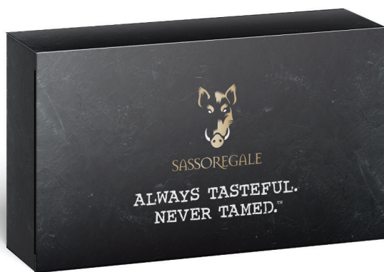
RED Blitz Spice Gift