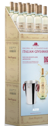
Case Glorifiers 12" W x 23.5" H