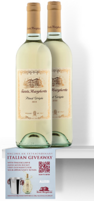
Shelf Talkers 3" W x 3.75" H