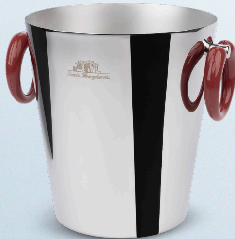
Alessi Moon Ice Bucket