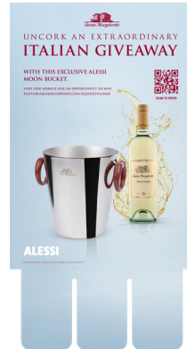
Double Sided Case Cards 13.53" W x 25.44" H