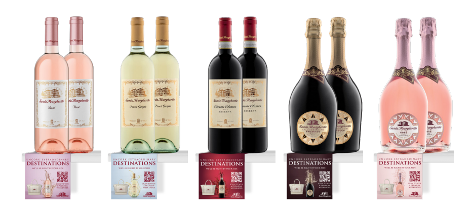
Shelf Talkers - 3" W x 3.75" H

Design to be used throughout T2. Each QR code leads the consumer to the sweepstakes entry page.