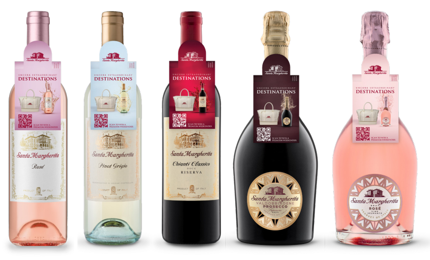
Neckers - 2.25" W x 4.5"H

Design to be used throughout T2. Each QR code leads the consumer to the sweepstakes entry page.