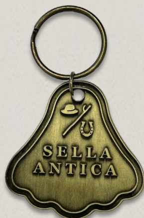
Antique Brass Key Chain 1.99" W x 2" L