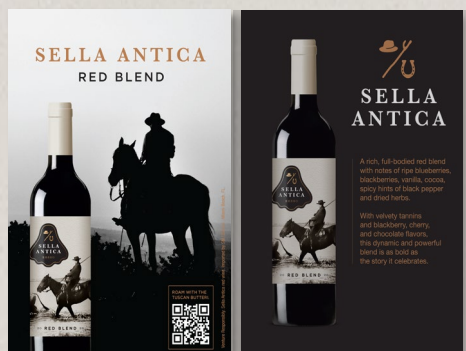
Double-Sided Tasting Cards 4.1" W x 5.8" L