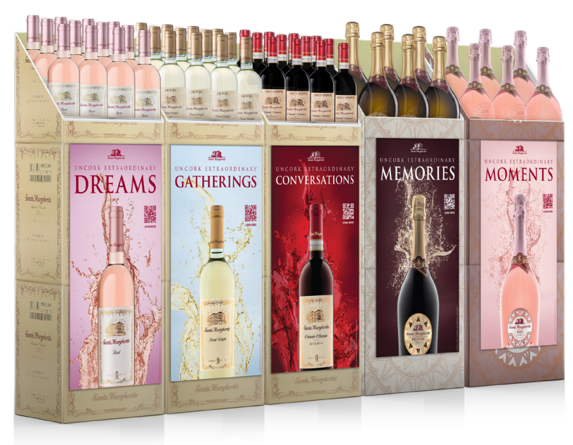
Case Glorifiers - 12" W x 23.5" H

Each QR code leads the consumer to our https://santamargheritawines.com/ product page video content.