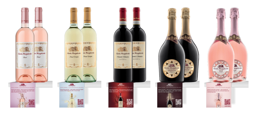
Shelf Talkers - 3" W x 3.75" H

Each QR code leads the consumer to our https://santamargheritawines.com/ product page video content.