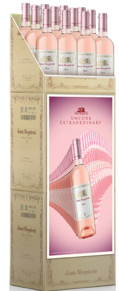
Glorifiers - 12" x 23.5"