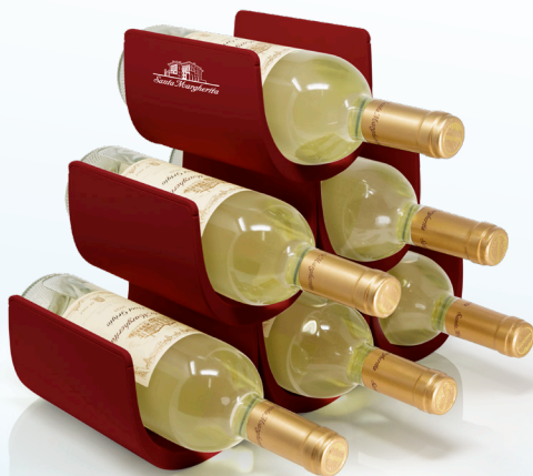
Alessi Wine Rack