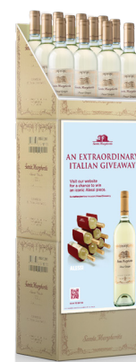
Glorifiers 12" L x 23.5" H