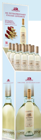
Case Sleeve Available from Flow 47.9" L x 36.6" H