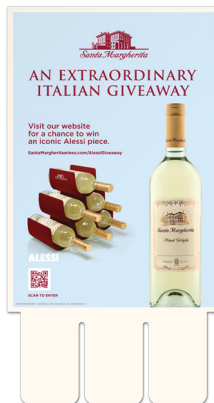
Case Cards 13.53" L x 25.44" H