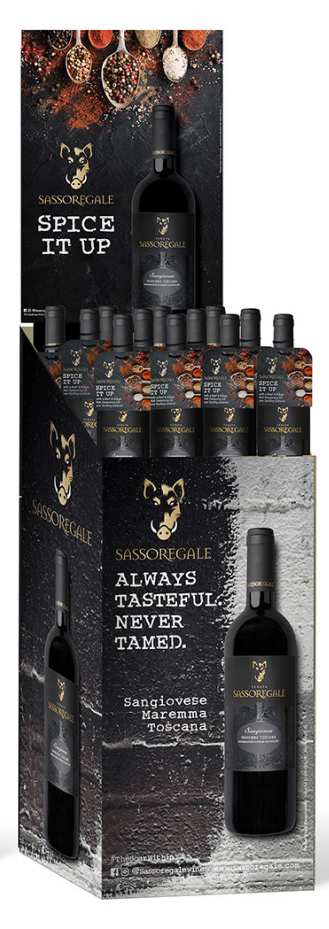
Sangiovese Flow Case Sleeve and T2 Case Card