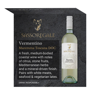
Print-Ready Shelf Talkers Sangiovese - Vermentino