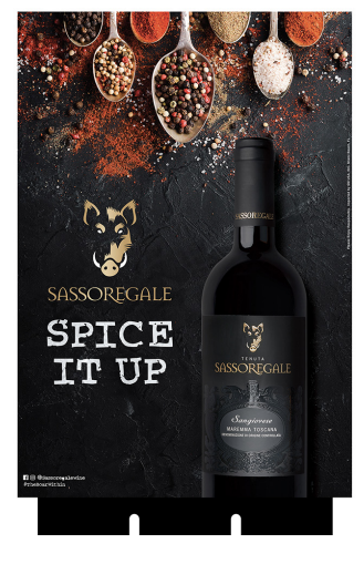
Sangiovese Case Cards