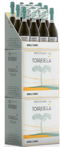
PROSECCO GIFT WRAP SCARF VAP CASE