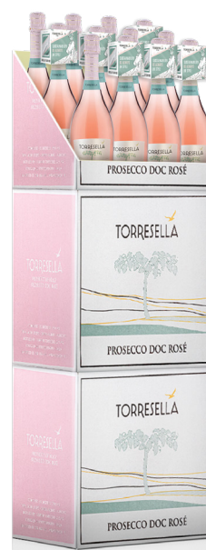
LOCALLY MERCHANDISED PROSECCO ROSÉ AND PINOT GRIGIO CASES

We continue our eco-friendly alternative to traditional wrapping paper this holiday season with the "Sustainability Is Always in Style" scarf VAP. This year's silk-like scarf is made from 100% recycled PET water bottles and comes packed inside our new VAP box, designed to slide through the bottleneck of all three wines. Our 2022 program will launch two flexible execution options intended for off-premise. Accounts will either receive the scarf VAPs pre-packed six on 12 in our Prosecco DOC cases from Italy or in VAP box cartons of 70 scarves for local merchandising.