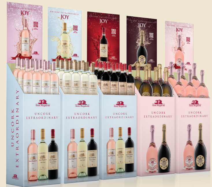
Double Sided Case Cards - 13.53" W x 25.44" H Design to be used throughout T3. Each QR code leads the consumer to varietal landing page.