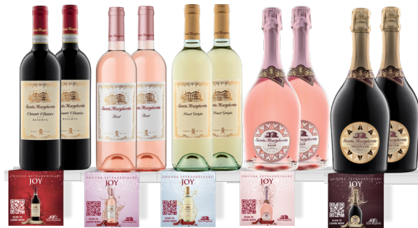
Shelf Talkers - 3" W x 3.75" h Design to be used throughout T3. Each QR code leads the consumer to varietal landing page.