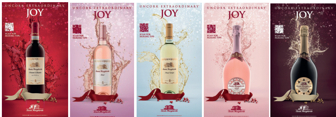
Case Glorifiers - 12" W x 23.5" H

Santa Margherita has been a leader in the premium wine industry for over 30 years, and we are proud to consistently earn our place as the #1 imported, luxury Italian wine brand over $20 in the United States*.