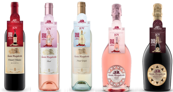
Neckers- 2.25" W x 4.5" H Design to be used throughout T3. Each QR code leads the consumer to varietal landing page